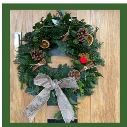
Examples of wreaths made before

Email the pta@biltonjuniorschool.co.uk to book a ticket