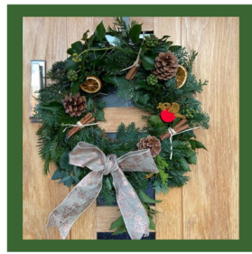
Examples of wreaths made before

Limited spaces so this will be a first come first served basis Email the pta@biltonjuniorschool.co.uk to book a ticket