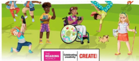
Illustrations by Natelle Quek and logo artwork by Lizzie Evesard. All © The Reading Agency 2024.